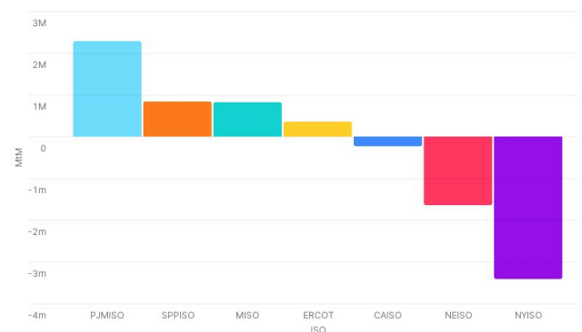
Total MtM by ISO (Example Participant)